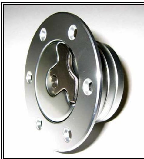
A 26 NS CAP WITH NECK