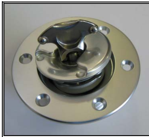
A 26 S CAP