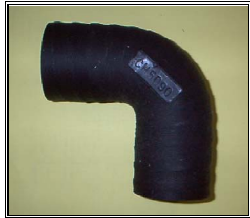
CH 5090 90 DEG HOSE