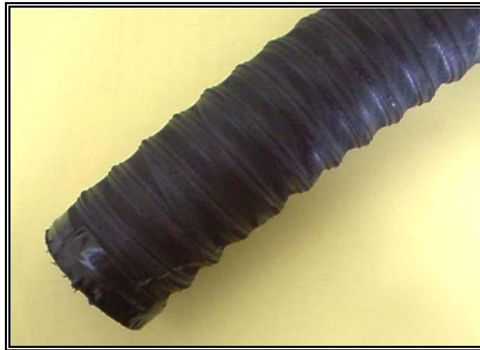
CH 51180 FLEXIBLE 50 mm FUEL HOSE

CH 5045 and CH 5090 HOSES. These moulded angle hoses (50 mm Internal Diameter) fit on the back of all the 50 mm (2") Filler Cap necks. A 50 mm (2") tube may be inserted the other end to take fuel towards the tank.