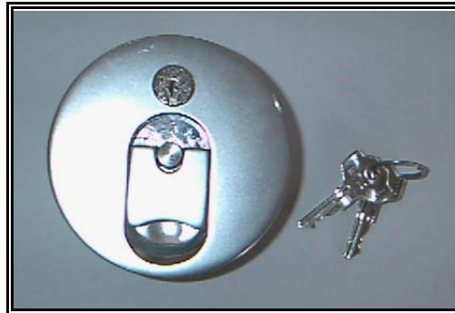
A4L CAP CENTRE