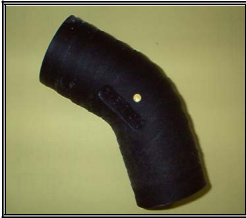
CH 5045 45 DEG HOSE