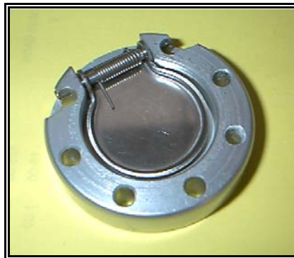
UNDERSIDE OF ULP 1 RESTRICTOR