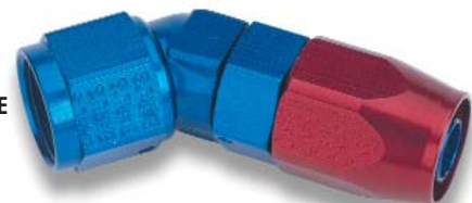
45° LOW PROFILE 8045__ERL