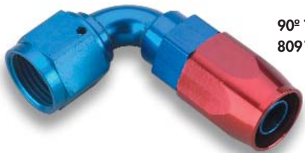
90° TUBE 8091__ERL