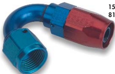
150° TUBE 8150__ERL