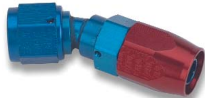
30° TUBE 8031__ERL