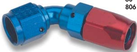
60° TUBE 8061__ERL