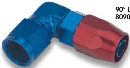
90° LOW PROFILE 8090__ERL