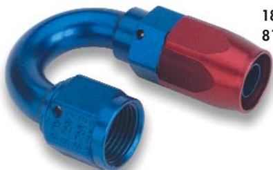
180° TUBE 8180__ERL