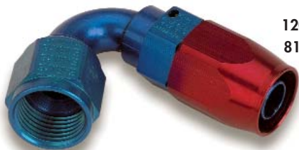
120° TUBE 8120__ERL