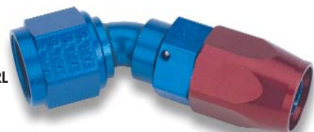
45° TUBE 8046__ERL