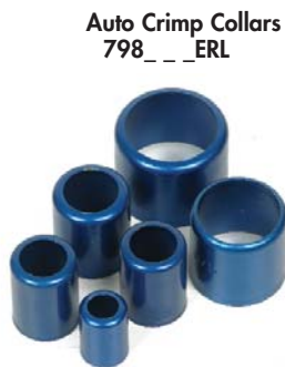
Auto Crimp Collars 798__ERL