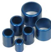
Auto Crimp Collars 798__ERL