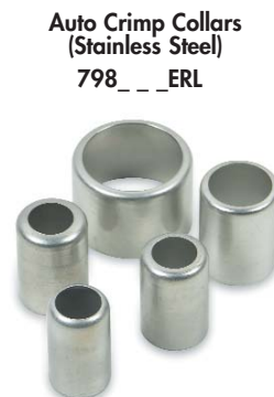
Auto Crimp Collars (Stainless Steel) 798__ERL