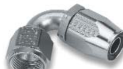
120° (unanodized) UP3120__ERL