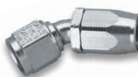
45° (unanodized) UP3046__ERL