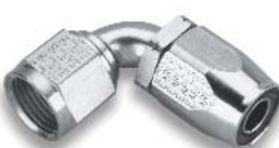
90° (unanodized) UP3091__ERL