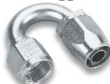
180° (unanodized) UP3180__ERL