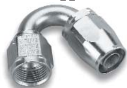
150° (unanodized) UP3150__ERL