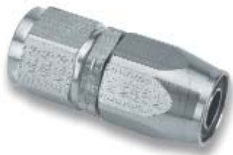
STRAIGHT (unanodized) UP3001__ERL

NOTE: Unanodized hose ends and adapters must be clear coated or anodized before assembly.